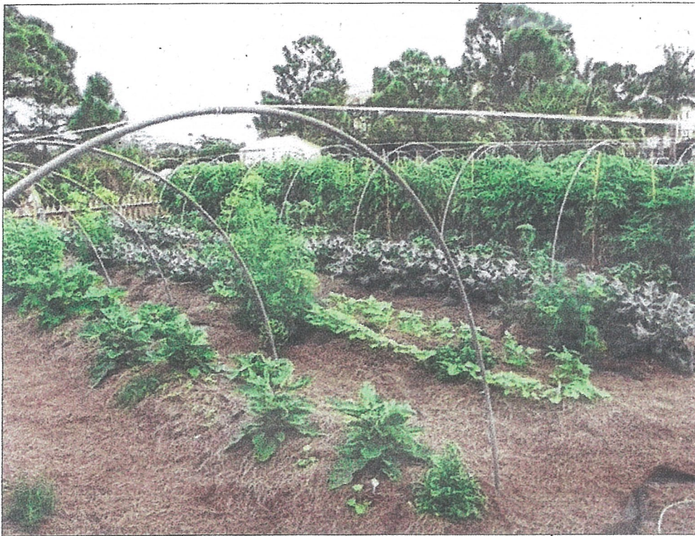
Volunteers at the small garden in Mainstreet at Midtown off PGA Boulevard grow vegetables including tomatoes, kale, cabbage, green beans, eggplant, broccoli and onions that are donated to charity. CONTRIBUTED